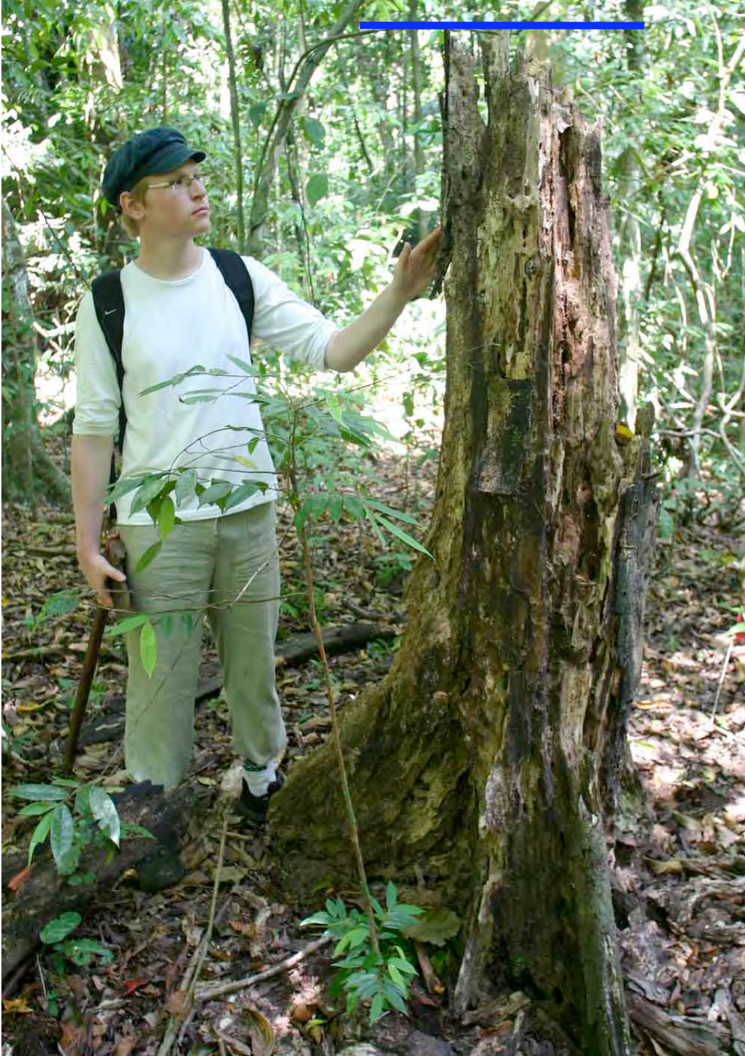
Photo 2. Measure the height of pieces of standing woody debris from the top (marked with a blue line).