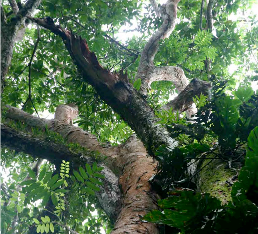
Photo 1. When the base of a broken branch can be seen in the canopy it is certain from which tree the branch has fallen.